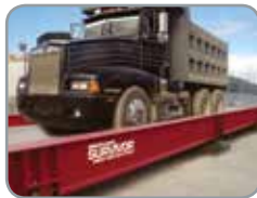
SURVIVOR® SR Extreme-duty, low profile concrete or steel deck siderail scales