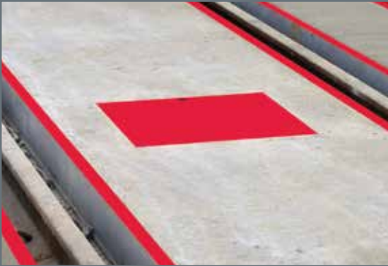
Boltless access covers and suspension system