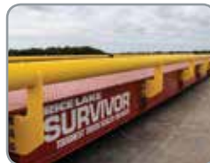
SURVIVOR® OTR Top access, low profile concrete or steel deck scales