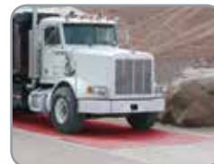
SURVIVOR® PT Pit-type concrete or steel deck scales