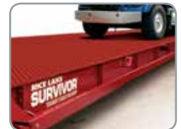
SURVIVOR® ATV Heavy- and super-duty top access portables